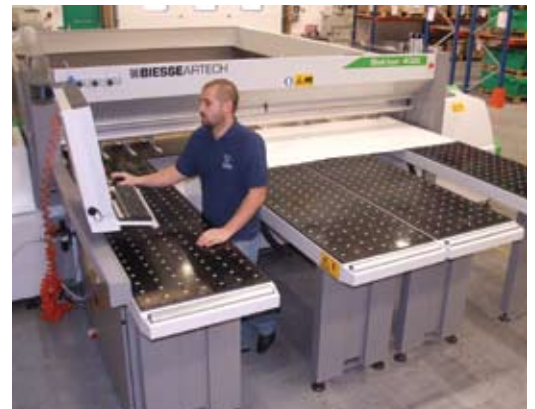
Eagle Plastics new high precision beam saw

Supply Line - call 0116 276 6363 to discuss your requirements