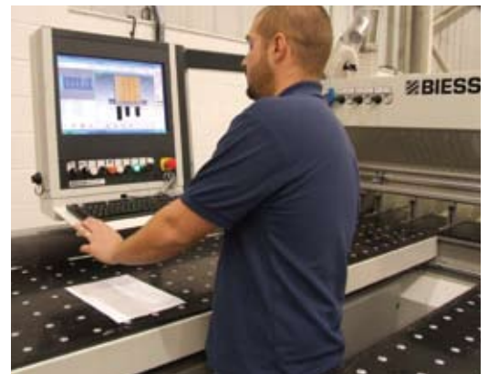
Computerised planning ensures maximum yield and minimal waste.